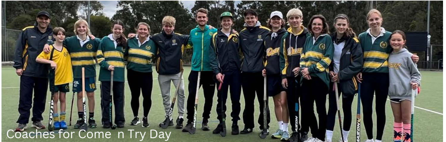
Coaches for Come n Try Day