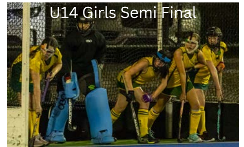
U14 Girls Semi Final