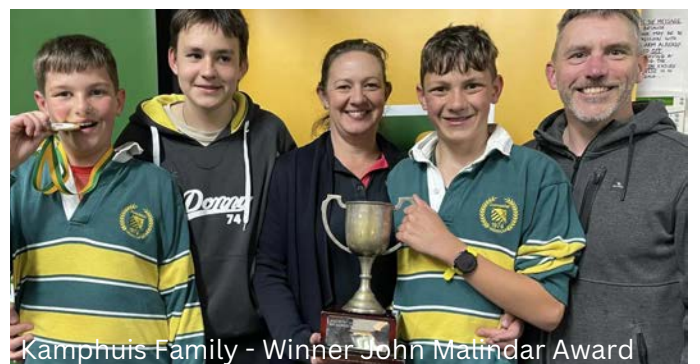
Kamphuis Family - Winner John Matindar Award