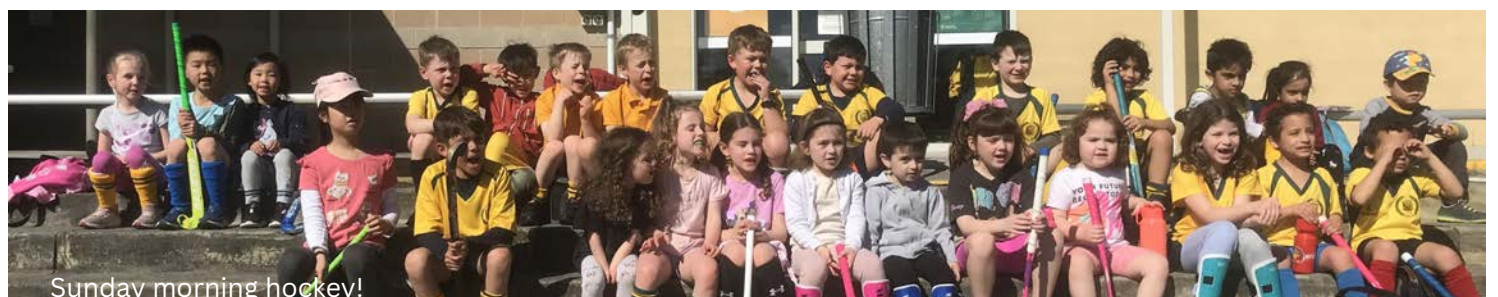
Sunday morning hockey!