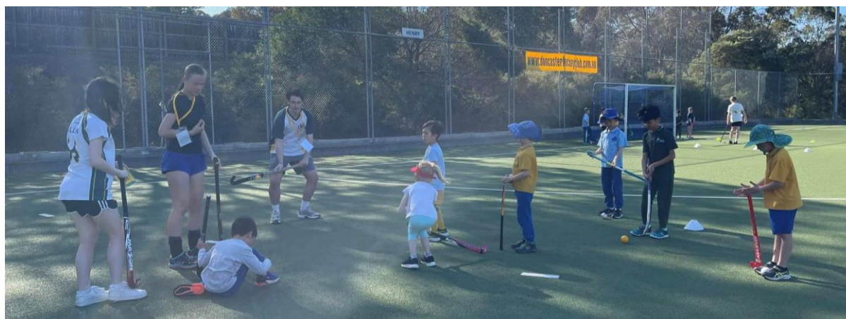
Come and Try Day Sept 2022