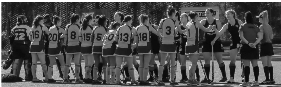
Anzac Day Game vs Essendon at DHC