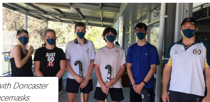
Return to hockey with Doncaster COVIDsafe facemasks