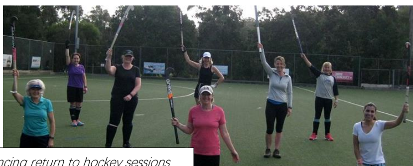
Social distancing return to hockey sessions