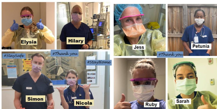
Doncaster Hockey Club COVID-19 medicos

Doncaster Hockey Club is welcoming and inclusive, delivering opportunity for both participation and excellence for our diverse community.