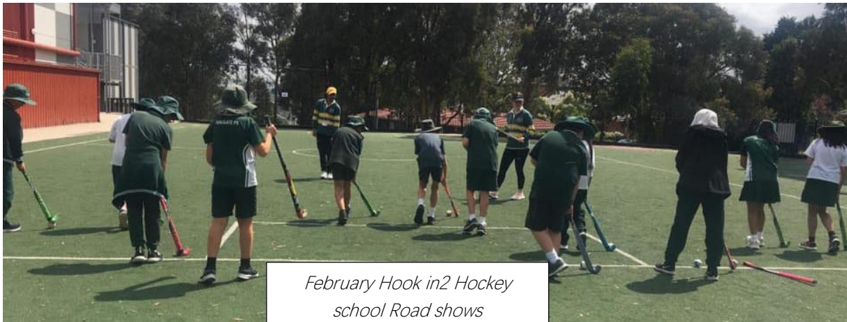
February Hook in 2 Hockey school Road shows