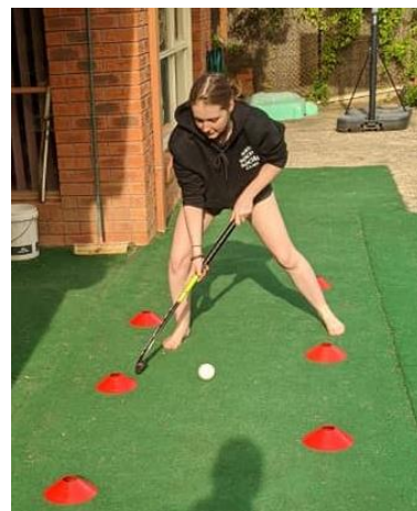
At home lockdown challenges